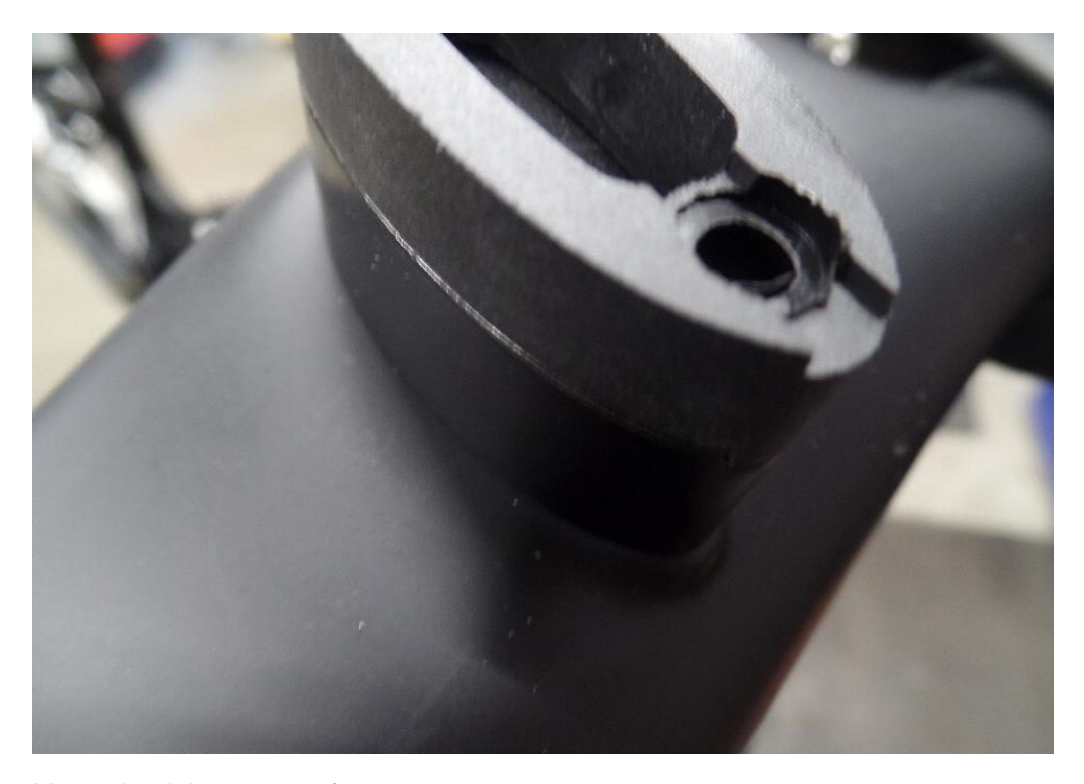
Mount the right amount of spacers:

The plastic spacers fit perfectly in the alloy part: