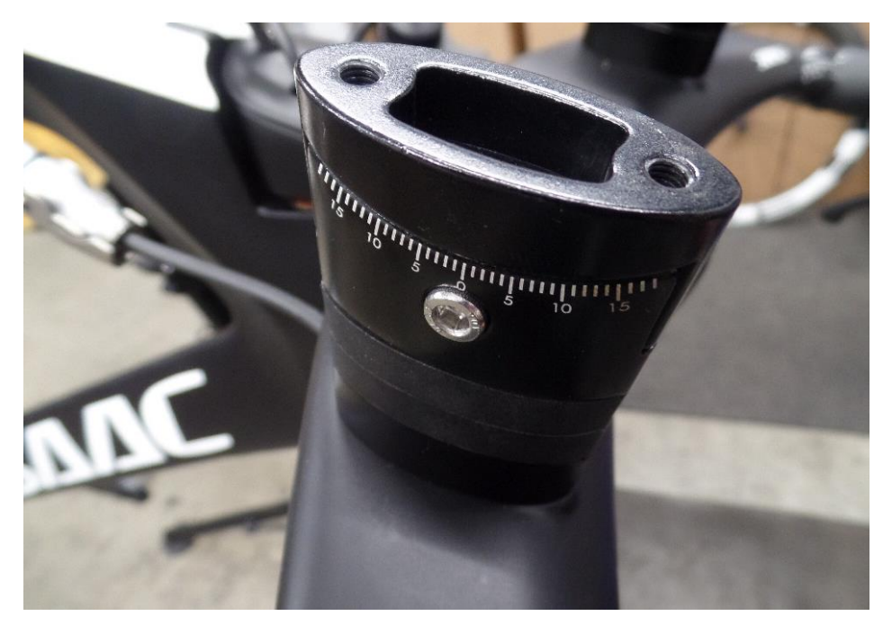
At last the carrier from the extensions should be mount on the alloy part.